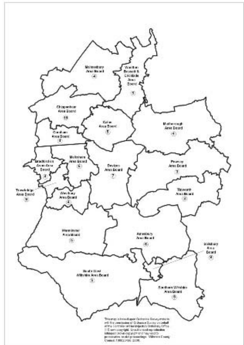
Wiltshire Area Boards